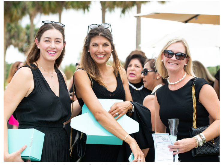
Since 1988, The Children's Healing Institute has guided parents through times of crisis, challenges, and disruptive changes successfully to ensure children are safe in their own homes, families feel supported, and parents are fully equipped to nurture and care for their children.